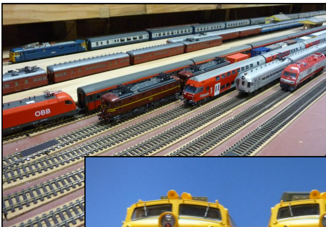
Electric locos at Read Yard, during Electric Traction night in early 2010 on AMRA NSW's HO layout.