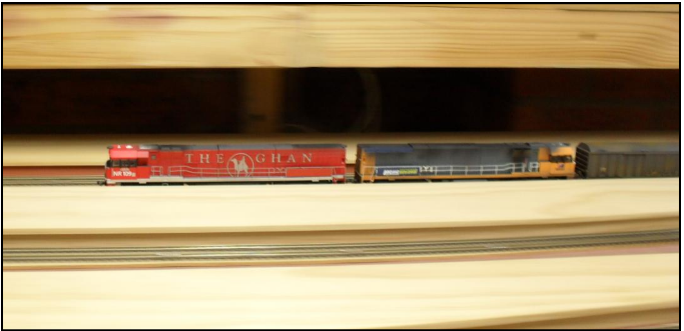
NR109 and NR90 travel through Read station with 7AS8 freight service on AMRA NSW's HO layout.

NSWGR (New south Wales Government Railways) 4206 and a VR (Victorian Railways) S class with coal wagons are stationed at MacLeod while waiting for a green signal to depart to the down main on AMRA NSW's HO layout.