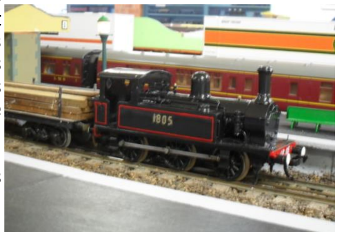
Tank loco 1805 stands at Central station on AMRA's O Scale layout.