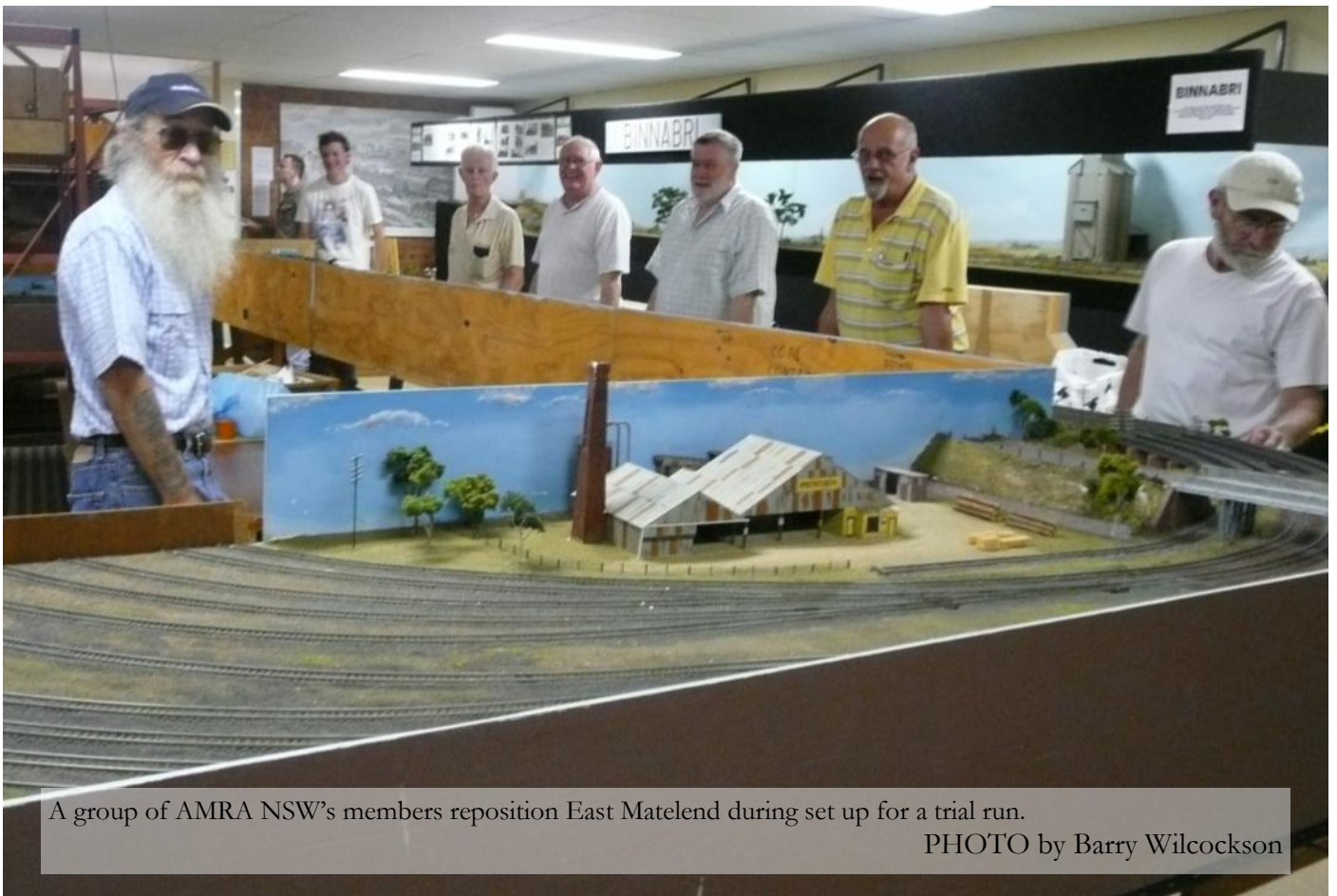
A group of AMRA NSW's members reposition East Matelend during set up for a trial run.